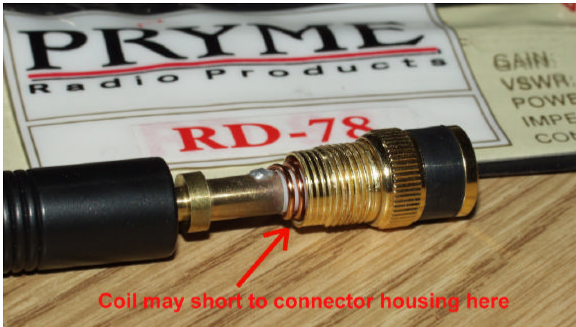
Figure 1: The loading coil is uninsulated and can short against the BNC connector body, resulting in possible damage to a radio in transmit.

Users of this antenna should be aware that a potential short circuit exists within the connector and loading coil of the unit. Figure 1 illustrates the problem: The manufacturer has included a bare copper loading coil in the base of the antenna. When the antenna is in use, there is enough play in the assembly for it to touch the sides of the connector. This will result in an intermittent short being presented to the transceiver.